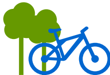
PARKS AND TRAILS