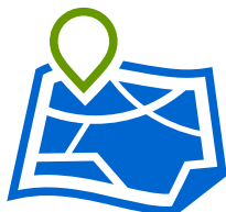
ECONOMIC DEVELOPMENT & HOUSING